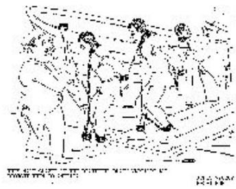
Click for full size picture. (12K)